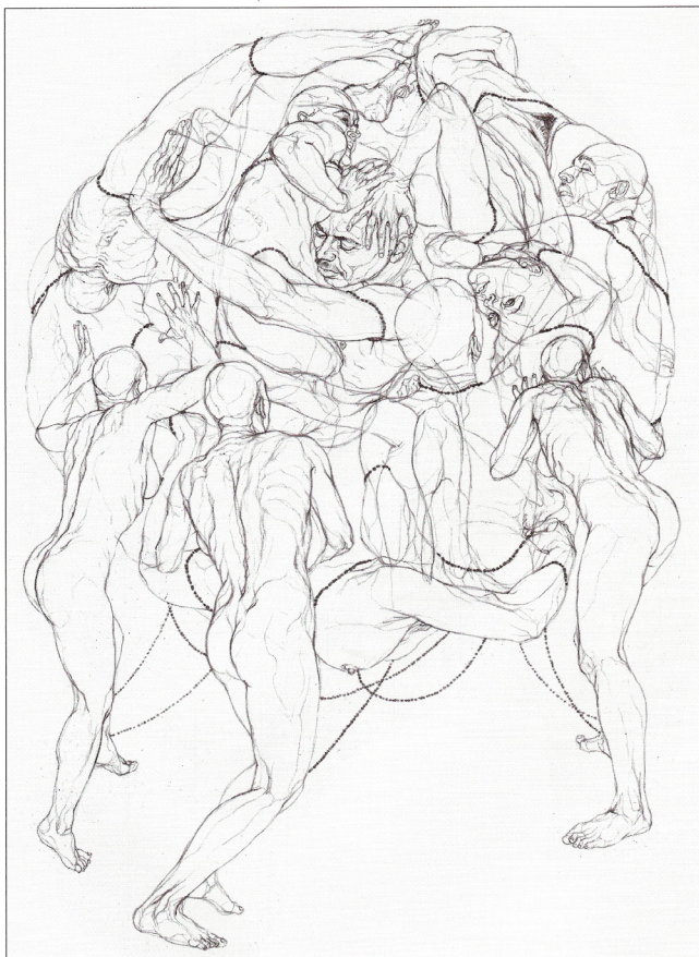
Figure App-29. Sol Kjøk, Norwegian, String of Beads 38 , 2003. Pencil and colored pencil on paper, 13 3 / 4 x 11 3 / 8 inches. Courtesy of the artist.