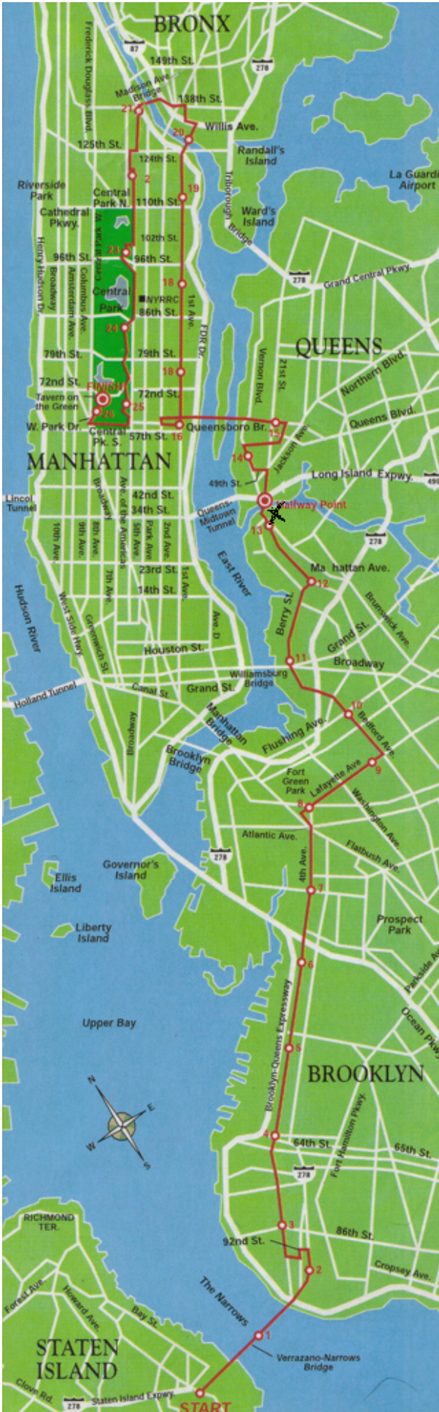
Located by the Pulaski Bridge, the halfway point of the NYC Marathon