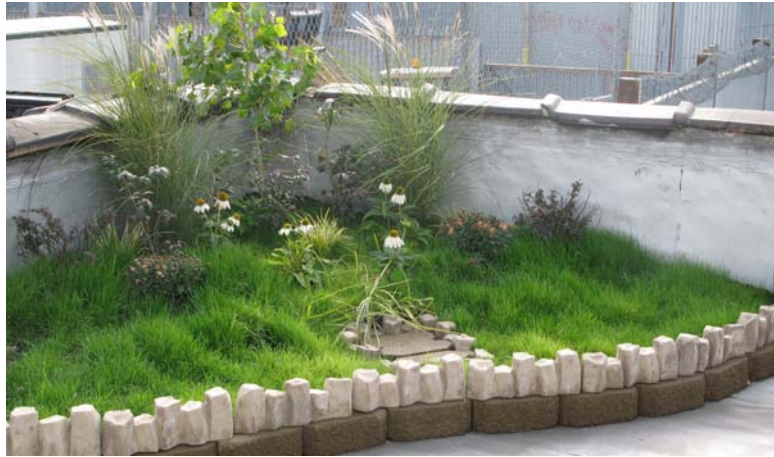
Garden corner (in summer, there is a little fountain, too...) ← View from roof (backstage New York City)