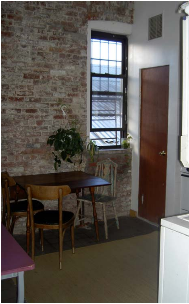
↑ Fully equipped kitchen with washer/dryer