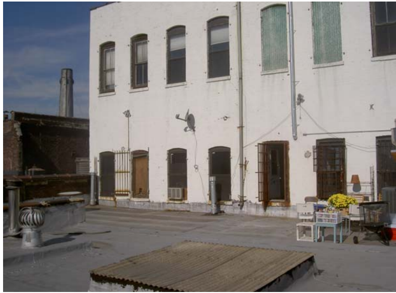
Living room opens up onto private roof deck