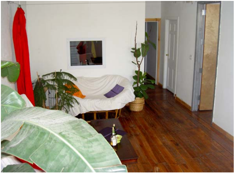
Behind couch: Tiny guest room with internal window