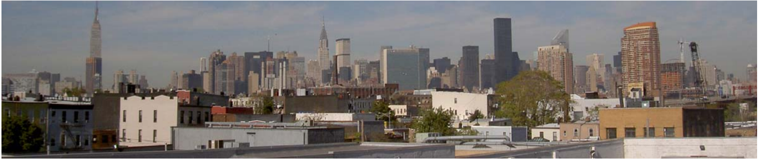
View from the fire escape in front of building ↑