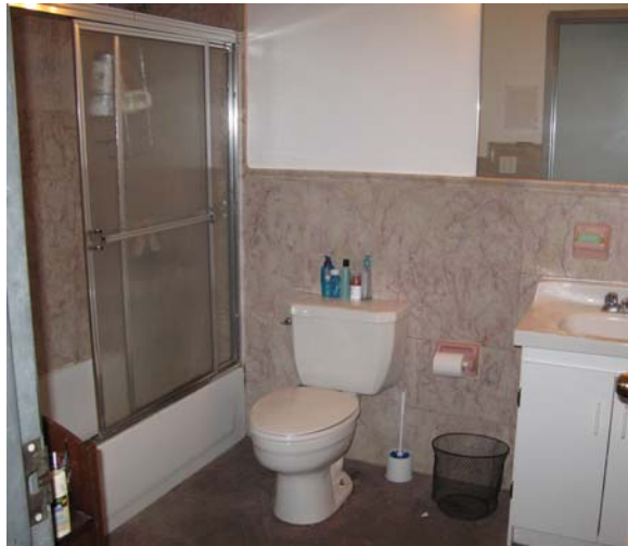
← Two full bathrooms Hallway seen from living room towards Sol's painting studio