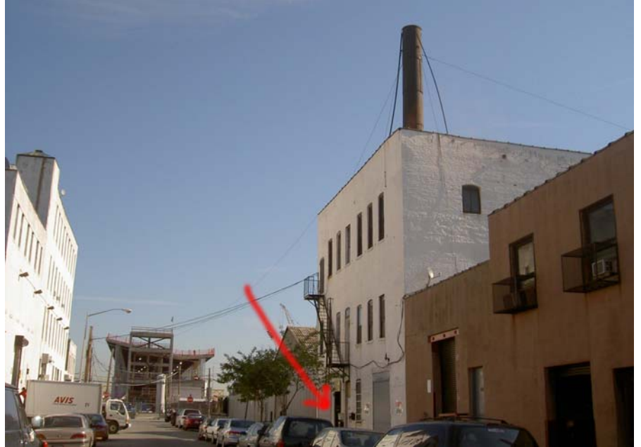
252 Green Street, apartment 2 left, second floor