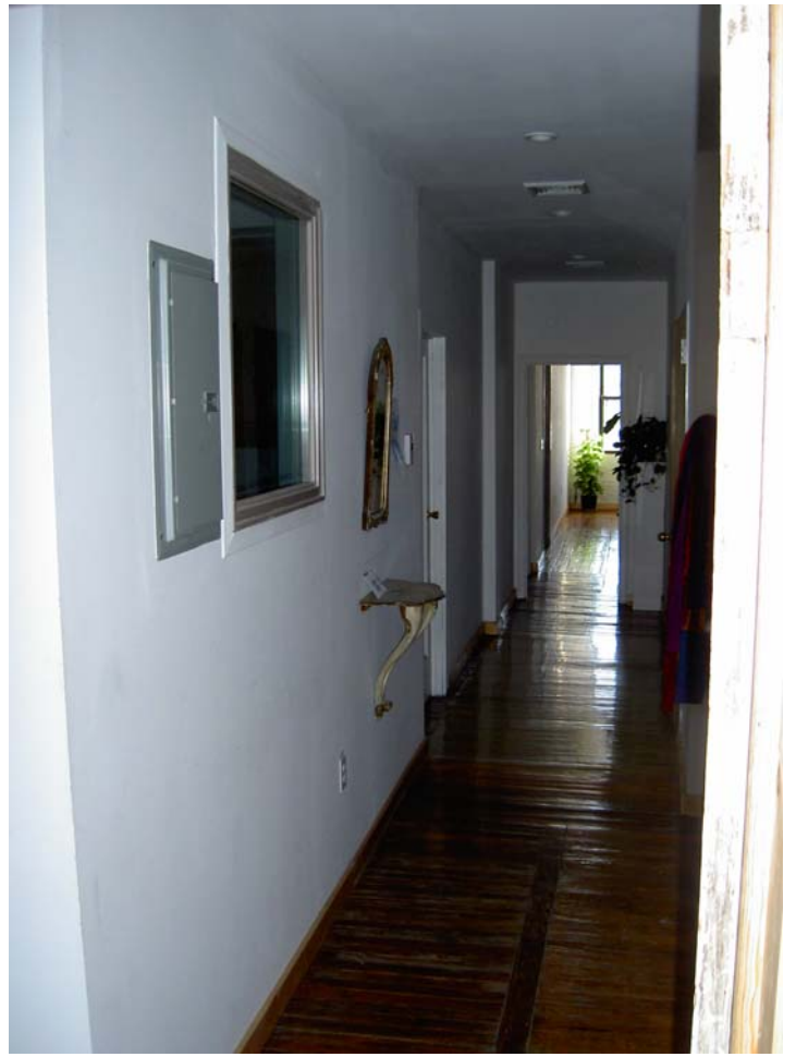
↑ Three main bedrooms to the left, bathrooms to the right.